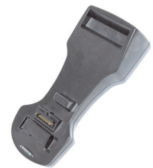
CONVENIENT CHARGING DOCK